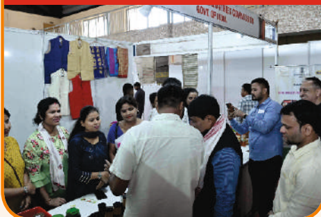
KVIC, GOVT. OF INDIA