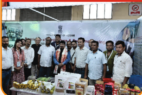
DIRECTORATE OF HORTI. & FOOD PROCESSING, ASSAM