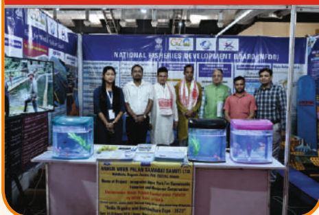
NFDB, GOVT. OF INDIA