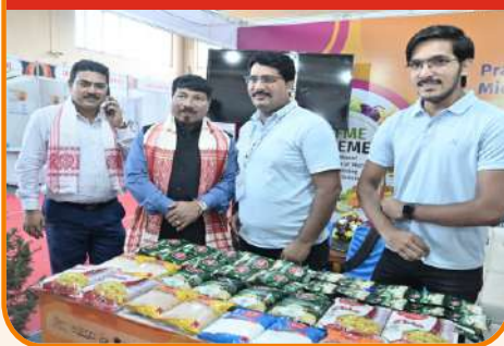
AIDC LTD., GOVT. OF ASSAM