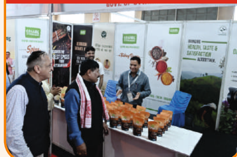
UK ORGANIC COMODITY BOARD