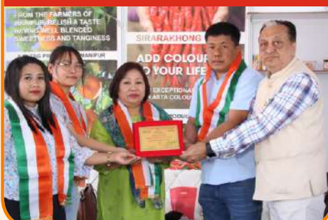
MANIPUR ORGANIC MISSION AGENCY