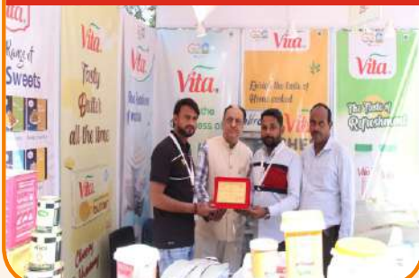
HARYANA DAIRY DEV. COOPERATIVE FED. LTD.