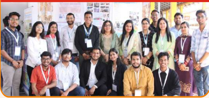
DELHI PHARMACEUTICAL SCIENCES AND RESEARCH UNIVERSITY