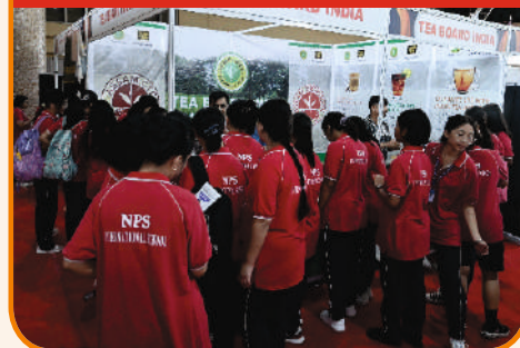
TEA BOARD INDIA