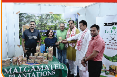
AMALGAMATED PLANTATIONS PVT. LTD.