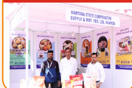
HAFED LTD., HARYANA