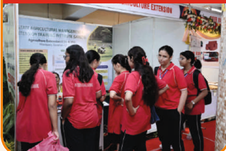
SAMETI, ASSAM/ AGRI. EXTENSION