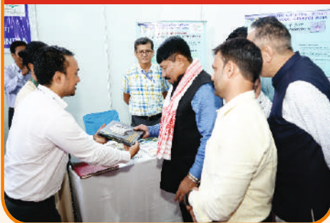
GSI, GOVT. OF INDIA