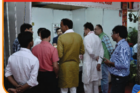
DIRECTORATE OF AGRICULTURE, ASSAM