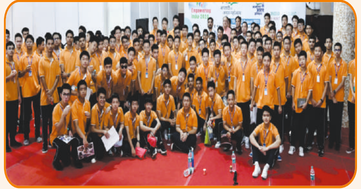
COIR BOARD, GOVT. OF INDIA