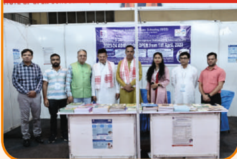
NIOS, GOVT. OF INDIA