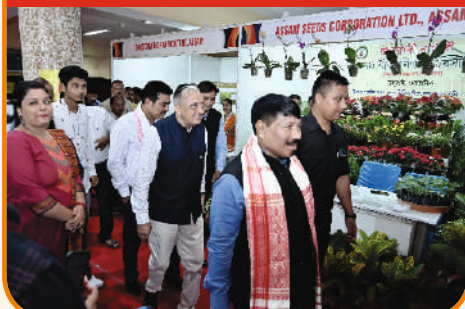
ASSAM SEEDS CORP. LTD.