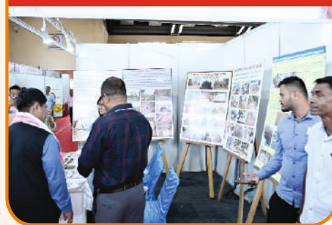
DIRECTORATE OF ARCHAEOLOGY, ASSAM