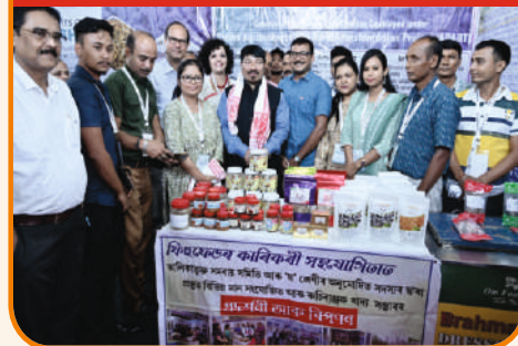
DIRECTORATE OF FISHERIES, ASSAM