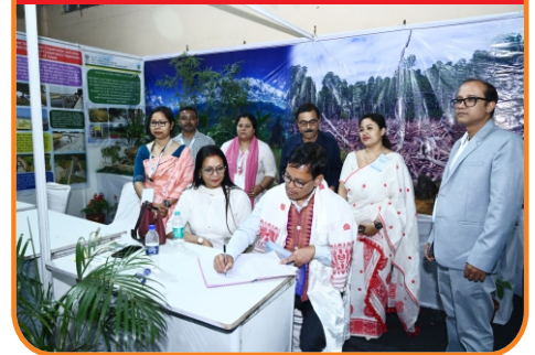
SOIL CONSERVATION DEPT. ASSAM