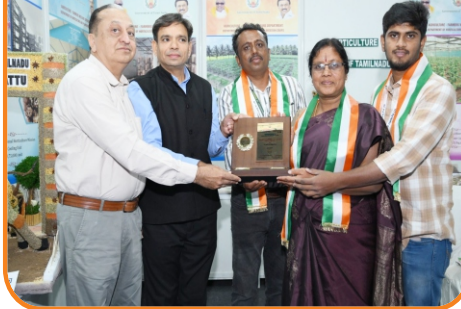
DEPT. OF HORTICULTURE-PLANTATION CROPS GOVT. OF TAMILNADU