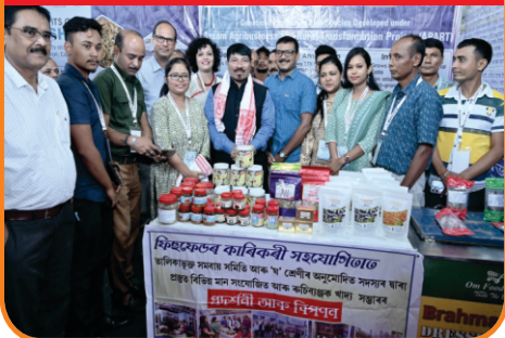
DIRECTORATE OF FISHERIES, ASSAM