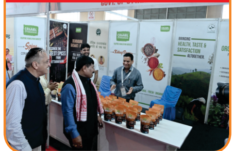
UK ORGANIC COMODITY BOARD