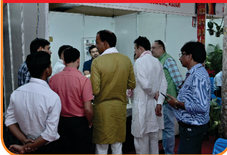
DIRECTORATE OF AGRICULTURE, ASSAM