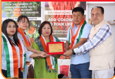
MANIPUR ORGANIC MISSION AGENCY