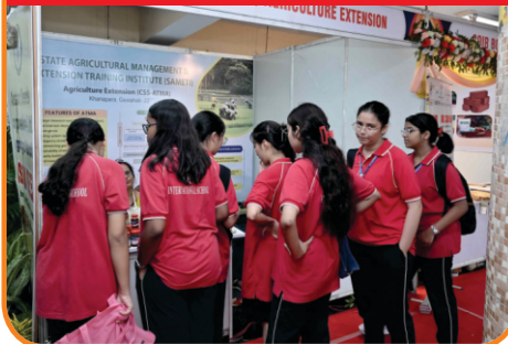
SAMETI, ASSAM/ AGRI. EXTENSION