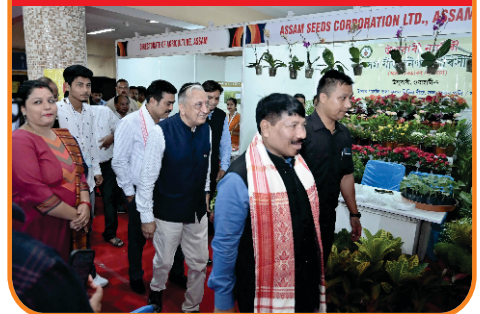
ASSAM SEEDS CORP. LTD.