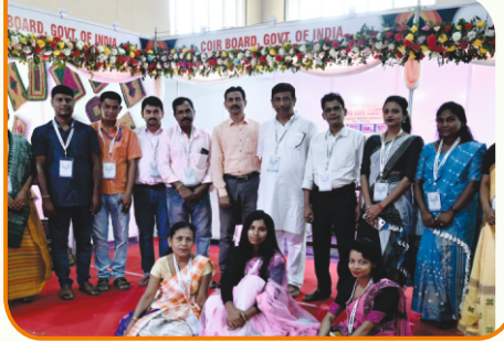
COIR BOARD, GOVT. OF INDIA