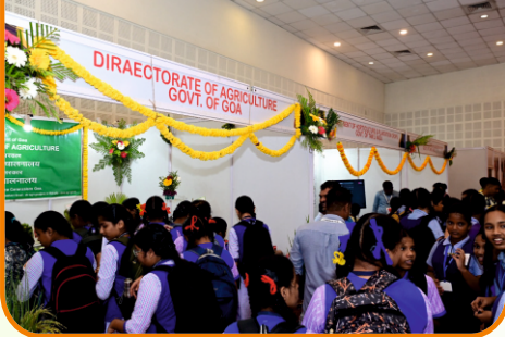
DIRECTORATE OF AGRICULTURE-GO A