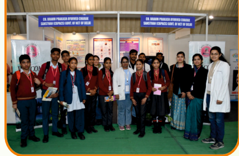
CBPACS, GOVT. OF DELHI